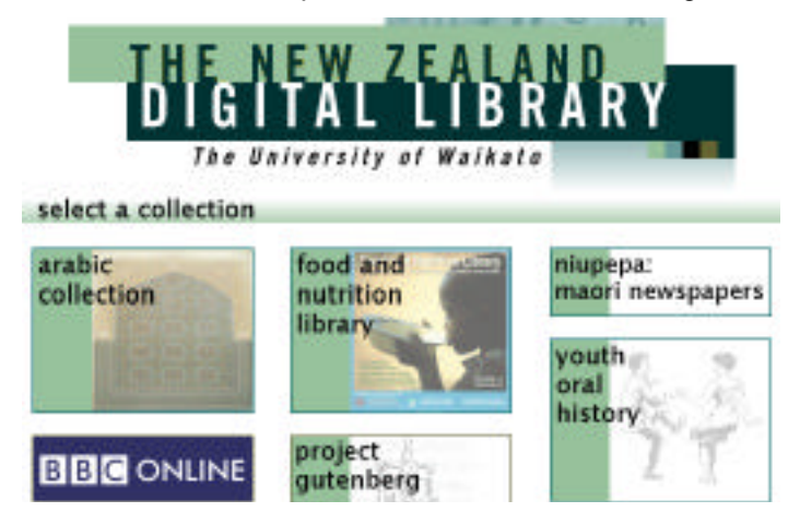
Figure 2: Screenshot showing some of the set of collections provided by NZDL

• to find the text of Jules Verne's Survivors of the Chancellor in the Gutenberg Collection via the NZDL