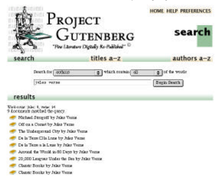
Figure 5: Results of searching for Jules Verne

Figure 5 also illustrates a potential cause of interactional trouble in the form of multiple entries for the same text e.g. two entries for De la Terre à la Lune , and two entries for Classic Books . Throughout the collection there are multiple entries with the same titles, typically representing texts submitted by different contributors, or from different sources. The presence of these identical entries raises an issue of discriminability - how easy it is to discriminate between different possible events. This issue could be addressed in future (re)designs by providing details of the difference between entries in the search results, or by collapsing texts of the same title into one entry.