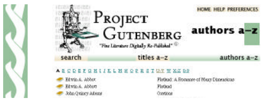
Figure 6: Access to authors and their works via author surname

selecting U-V. They key is that after communicating to the computer system their intention and interpreting the computer system's response the user realises their mistake, or detour, and rectifies it. This contrasts with blind alleys where the user proceeds for some time before realising their objective is not achievable along that trajectory and so must reset the interaction before finding an appropriate trajectory as opposed to retracing a few steps to carry on to the objective.